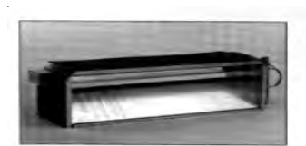
MOTORIZED FRESH AIR DAMPER

A blank off plate is installed on the inside of the service door. It covers the air inlet openings which restricts any outside air from entering the unit. The blank off plate should be utilized in applications where outside air is not required to be mixed with the conditioned air.