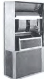
Unit shown with optional Economizer.