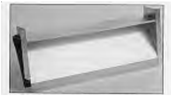
BAROMETRIC FRESH AIR DAMPER

Bard Wall-Mounts are designed to provide optional ventilation packages to meet all of your ventilation and indoor air quality requirements. Standard on all units is the barometric fresh air damper. All packages can be ordered built-in at the factory or can be easily field-installed at the time of installation of the Wall-Mount, or can be retrofitted at a later date.