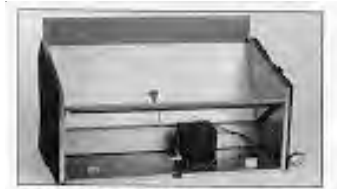
COMMERCIAL ROOM VENTILATOR

NOTE: The above vent systems are intake only without built-in exhaust capability. Building will likely require separate field installed barometric relief or mechanical exhaust elsewhere within the conditioned space. Balancing dampers in the return air grille may be required to achieve specified amount of outdoor air intake.