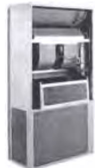
Unit shown with optional Economizer.