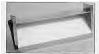
BAROMETRIC FRESH AIR DAMPER

Bard Wall-Mounts are designed to provide optional ventilation packages to meet all of your ventilation and indoor air quality requirements. Standard on all units is the barometric fresh air damper. All packages can be ordered built-in at the factory or can be easily field-installed at the time of installation of the Wall-Mount, or can be retrofitted at a later date.