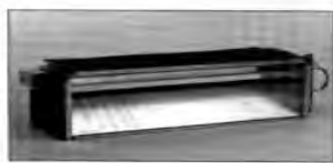
MOTORIZED FRESH AIR DAMPER

A blank off plate is installed on the inside of the service door. It covers the air inlet openings which restricts any outside air from entering the unit. The blank off plate should be utilized in applications where outside air is not required to be mixed with the conditioned air.