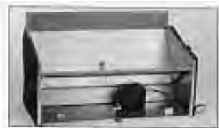
COMMERCIAL ROOM VENTILATOR

NOTE: The above vent systems are intake only without built-in exhaust capability. Building will likely require separate field installed barometric relief or mechanical exhaust elsewhere within the conditioned space. Balancing dampers in the return air grille may be required to achieve specified amount of outdoor air intake.